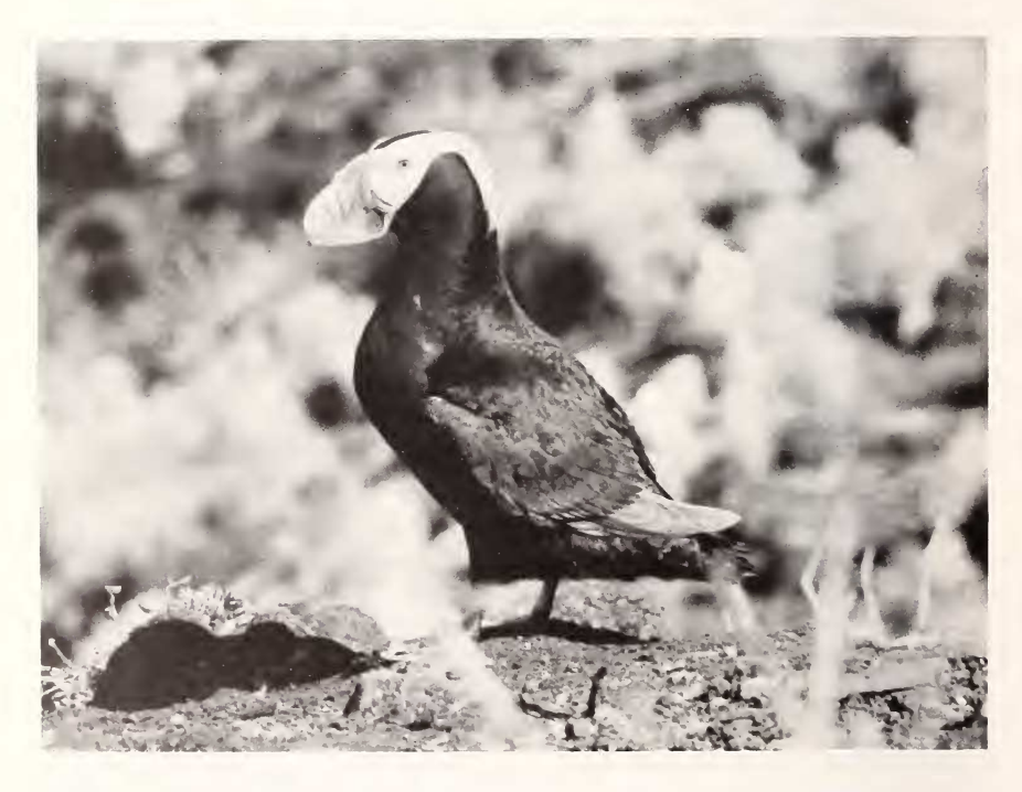
Fig. 20. Tufted puffin; Shaiak Island, July 1976.

At Shaiak Island, 30 5 × 5-m plots averaged 0.4 active burrows per square meter (SE = 0.04; range, 0–1.25). The first young in 1976 was found there on 17 July, and most eggs had hatched by 4 August. D. R. Herter and D. Lloyd (personal communication) found newly hatched chicks there on 13 and 25 July 1981. Of the 62 puffin nests that we monitored from the